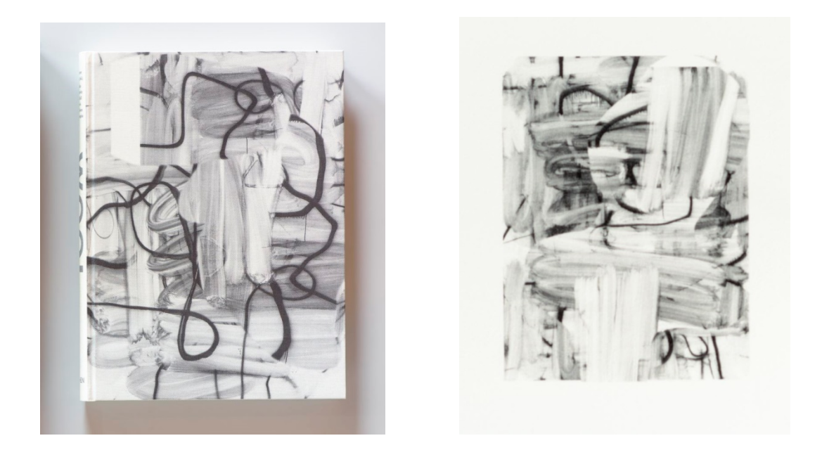
Christopher Wool, Christopher Wool , Special edition, 2008, number 57/100; Collection BFA; Photo's Peter Cox, Eindhoven, The Netherlands