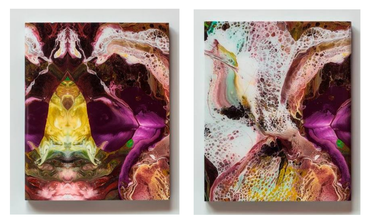
Gerhard Richter, Sindbad , 2010; Collection BFA

Gerhard Richter, Ifrit, chromogenic print [P8], 2015, number 387/500; Collection BFA