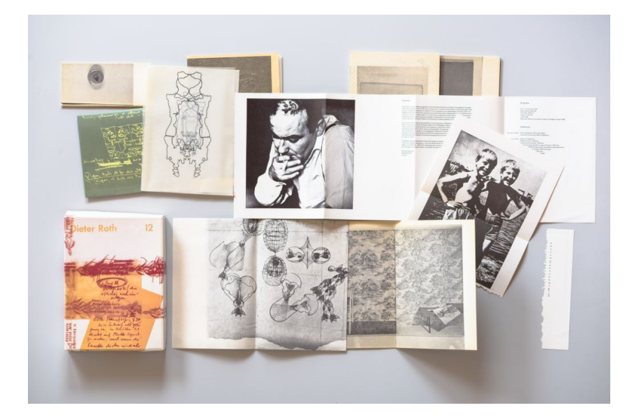
Dieter Roth, Coply book , 1974, Volume 12 of Collected Works, Collection BFA Photo Peter Cox, Eindhoven, The Netherlands