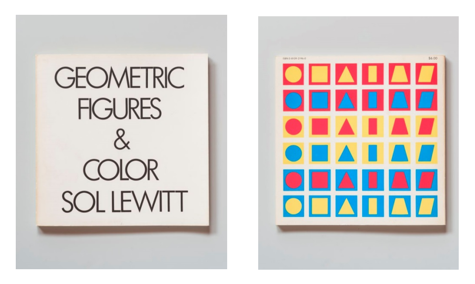
Sol LeWitt, Geometric Figures & Color , 1979, Collection BFA Photo's Peter Cox, Eindhoven, The Netherlands