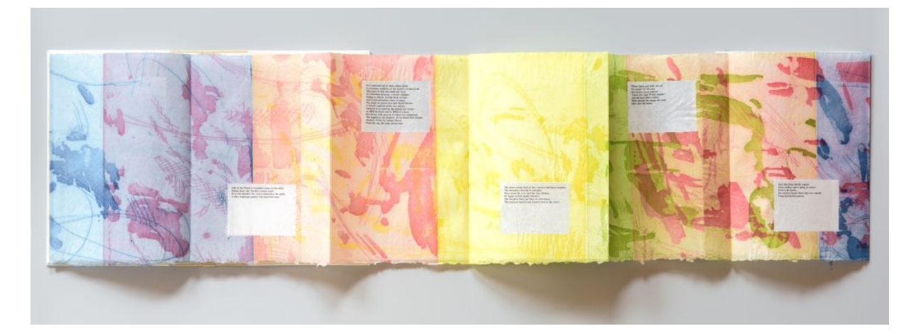
Richard Tuttle/W.H. Auden, Early Auden , 1991, number 4/80; Collection BFA