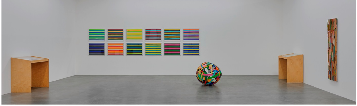
Gegevens bij foto's