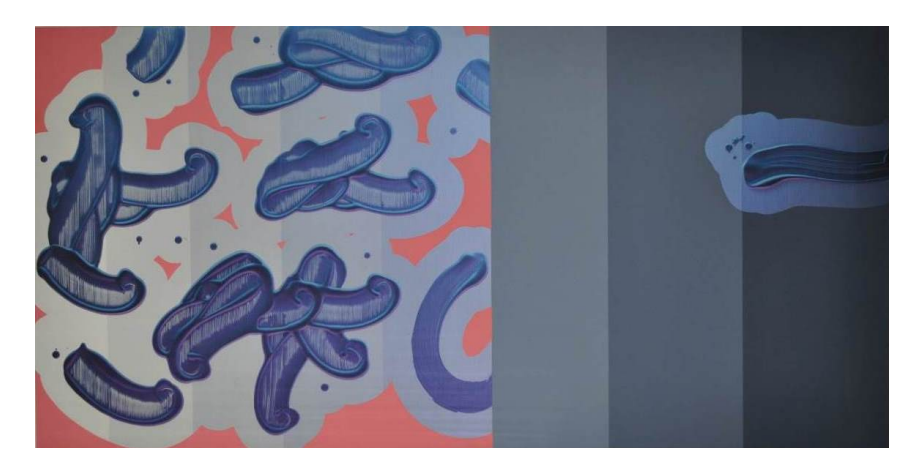
David Reed, Painting #385, 1997: Collection BFA