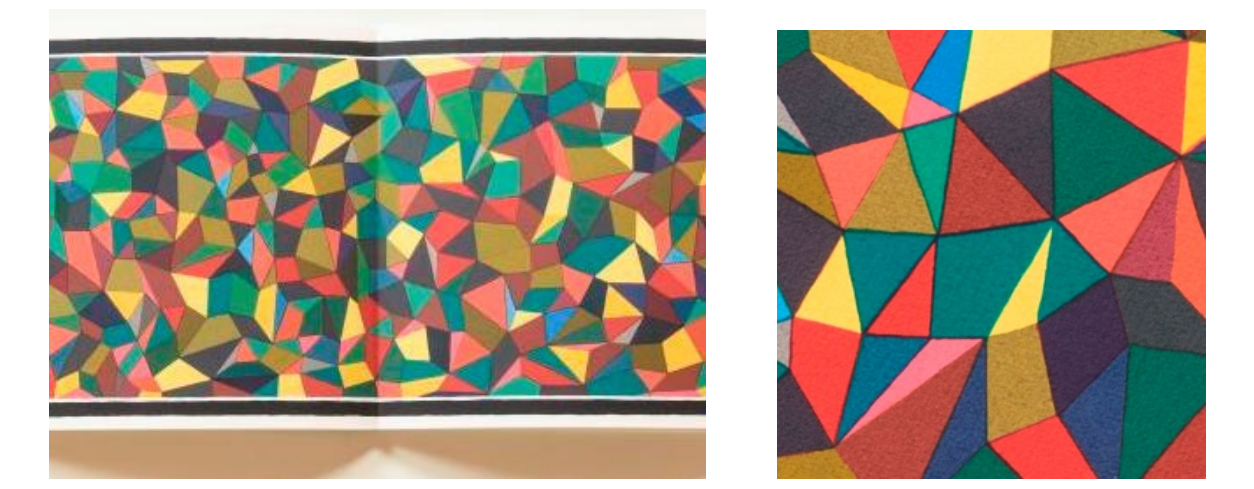
Sol LeWitt, Complex Forms , 1990, number 10/15, Details; Collection BFA Photo Peter Cox, Eindhoven, The Netherlands